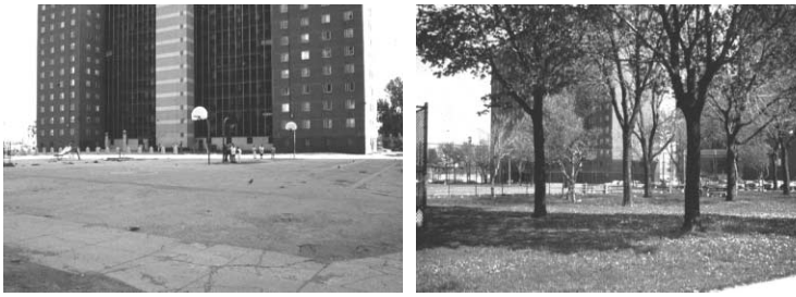
Figure 1: Attrition Has Left Some Buildings Surrounded Almost Entirely by Concrete and Asphalt and Others With Pockets of Green